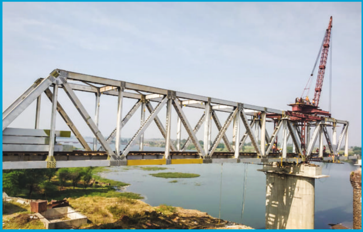
कर्नाटक में लोंडा मिराज परियोजना के लिए स्टील ब्रिज का निर्माण कार्य Construction work of steel bridge for Londa Miraj Project at Karnataka