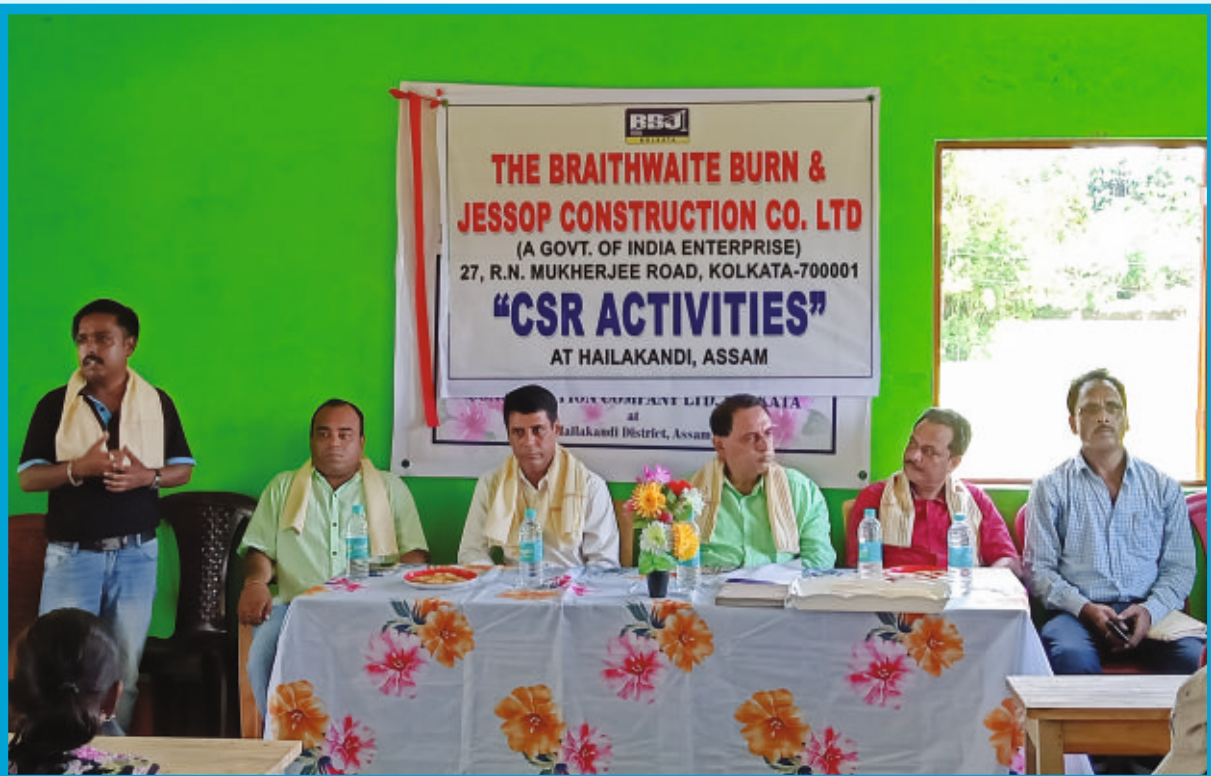
हैलाकांडी, असम में 2019-20 के लिए सीएसआर गतिविधियाँ CSR activities for 2019-20 at Hailakandi, Assam