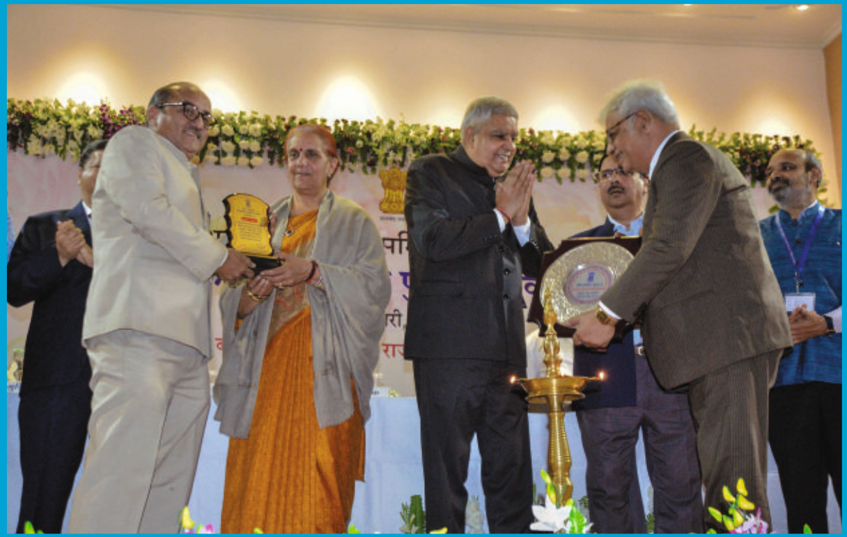
हिन्दी गृह पत्रिका : “बीबीजे दर्पण” प्रथम पुरस्कार से सम्मानित । अ. एवं प्र.नि., बीबीजे पश्चिम बंगाल के माननीय राज्यपाल से राजभाषा शील्ड प्राप्त करते हुए परिलक्षित हैं । Hindi House magazine : “BBJ Darpan” conferred with First prize. CMD, BBJ receiving the Rajbhasha Shield from Hon'ble Governor, West Bengal