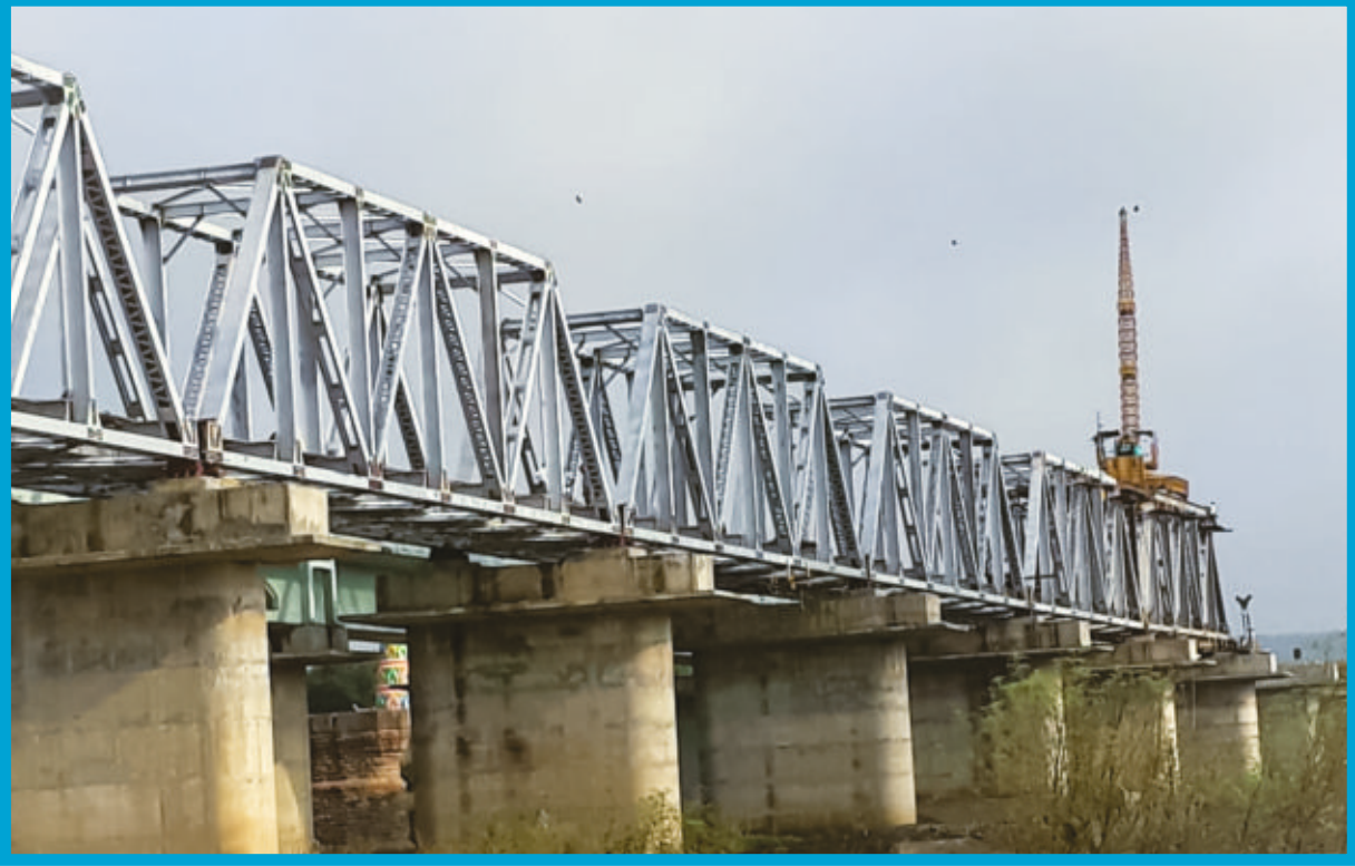
कर्नाटक में गडाग होटगी परियोजना के लिए स्टील ब्रिज का निर्माण कार्य Construction work of steel bridge for Gadag Hotgi Project at Karnataka